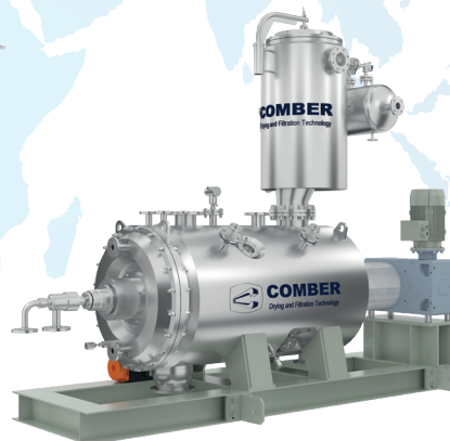
TERMOMIX® Horizontal Vacuum Dryer / Reactor