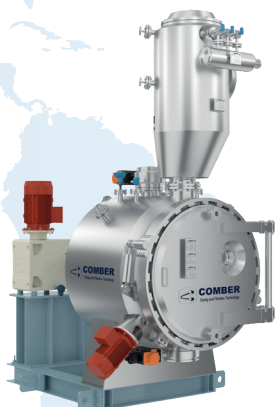
PHARMADRY® Paddle Dryer / Horizontal Vacuum Dryer