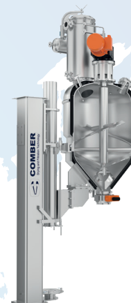
CONDRIY® Vertical Cone Vacuum Dryer