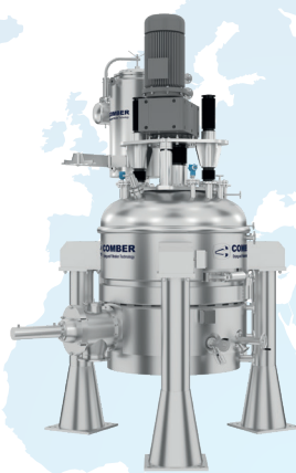
TURBODRY® Vacuum Pan Dryer